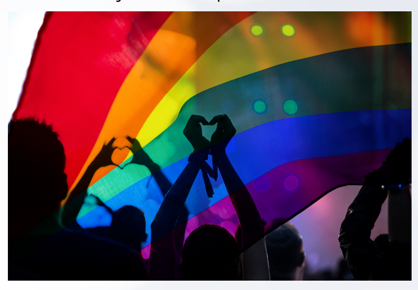
2024 - Copywright SAGE

The theme for the World Day of Social Justice in 2025 is expected to be "Empowering Inclusion: Bridging Gaps for Social Justice," which emphasizes the need for inclusive policies and actions to combat systemic inequalities